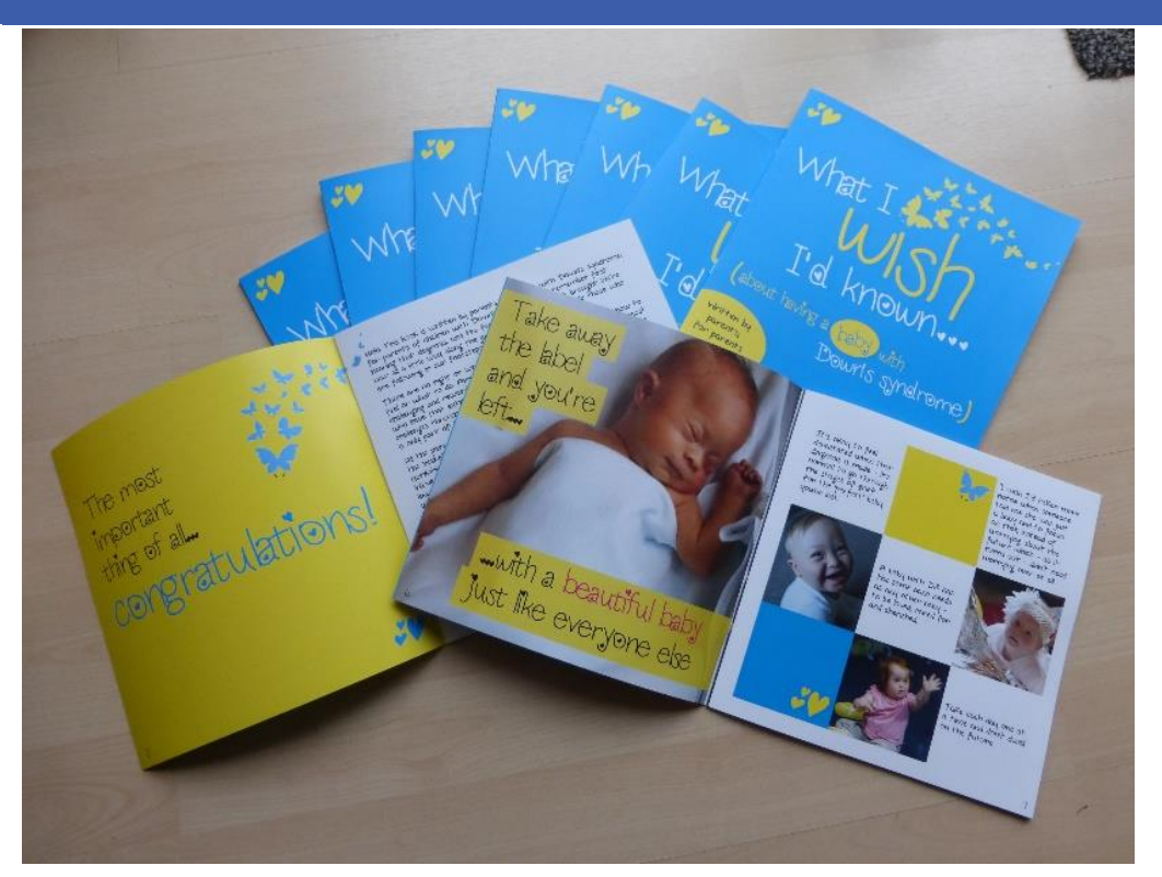
"My book came in the post today, wow, how powerful in making all my thoughts and feelings acceptable and 'normal'."

Our web site also has a special section for new parents, as a place to start.