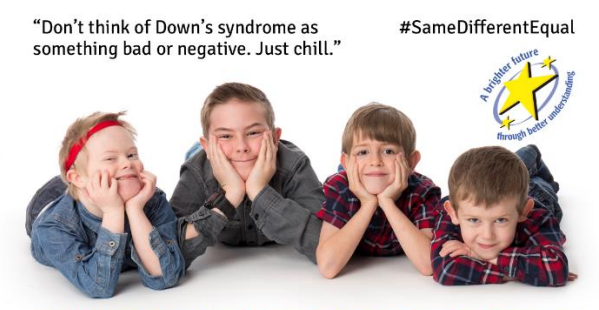
10,000 views for our World Down Syndrome Day video! Thank you!

For World Down's Syndrome Day, we created a very special project. With the help of Tres Belle Photography's very generous support, we were able to offer a family photo shoot to many of our families, enabling them to have some very precious photos of their